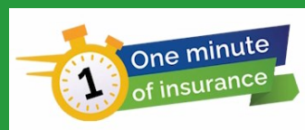
Renters insurance video