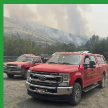
State Fire Marshal supports Gwen, Paddock fires