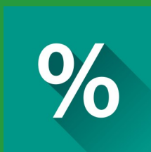
DOI publishes preliminary 2025 health insurance rates