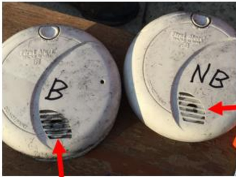
Smoke alarm sounded